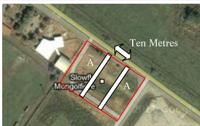
Task 3 - Minimum Distance Double Drop.

Two lines of tape will be laid out across the centre of the grass section of the balloon port. The tape will be ten metres apart. Result is shortest distance between both markers, one in each area 'A'. The area in the middle and also the tape is out. Boundary of scoring area is the fenced area around the site as shown by red line in this picture.